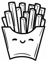
Chips/ French fries