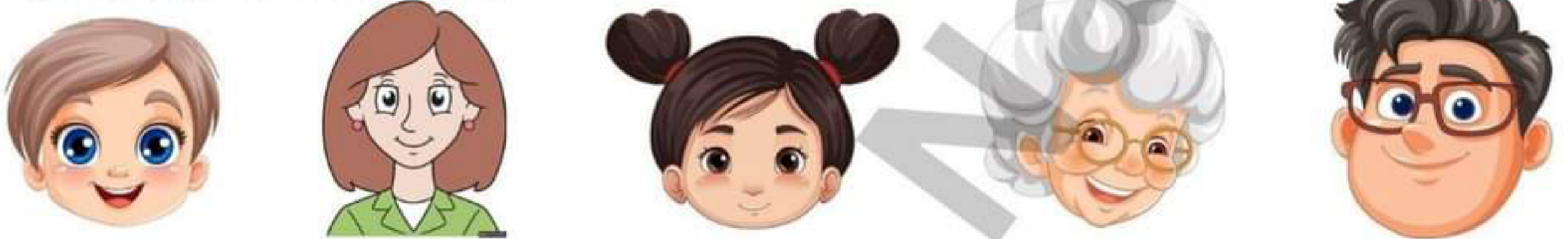
Grandmother Brother Sister Mother Father