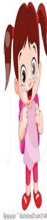
kyayaya * illustrationsCI.com/214860