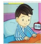
go to bed