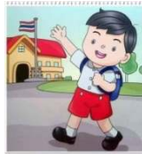
go to school