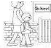
Amir goes to school