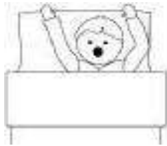
Amir gets up