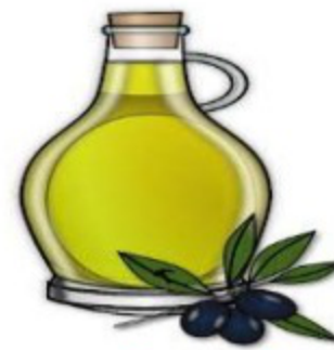
... olive oil ...