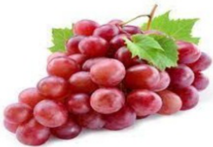
... grapes ...