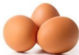
... eggs ...