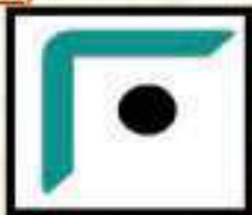
At the corner