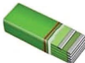
... chewing gum ...