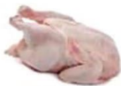
... chicken ...