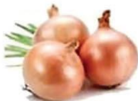
... onions ...