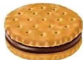
... biscuits ...