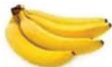
... bananas ...