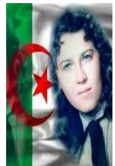
Glory to our martyrs